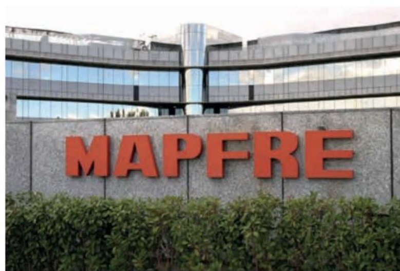
MAPFRE headquarters in Madrid.