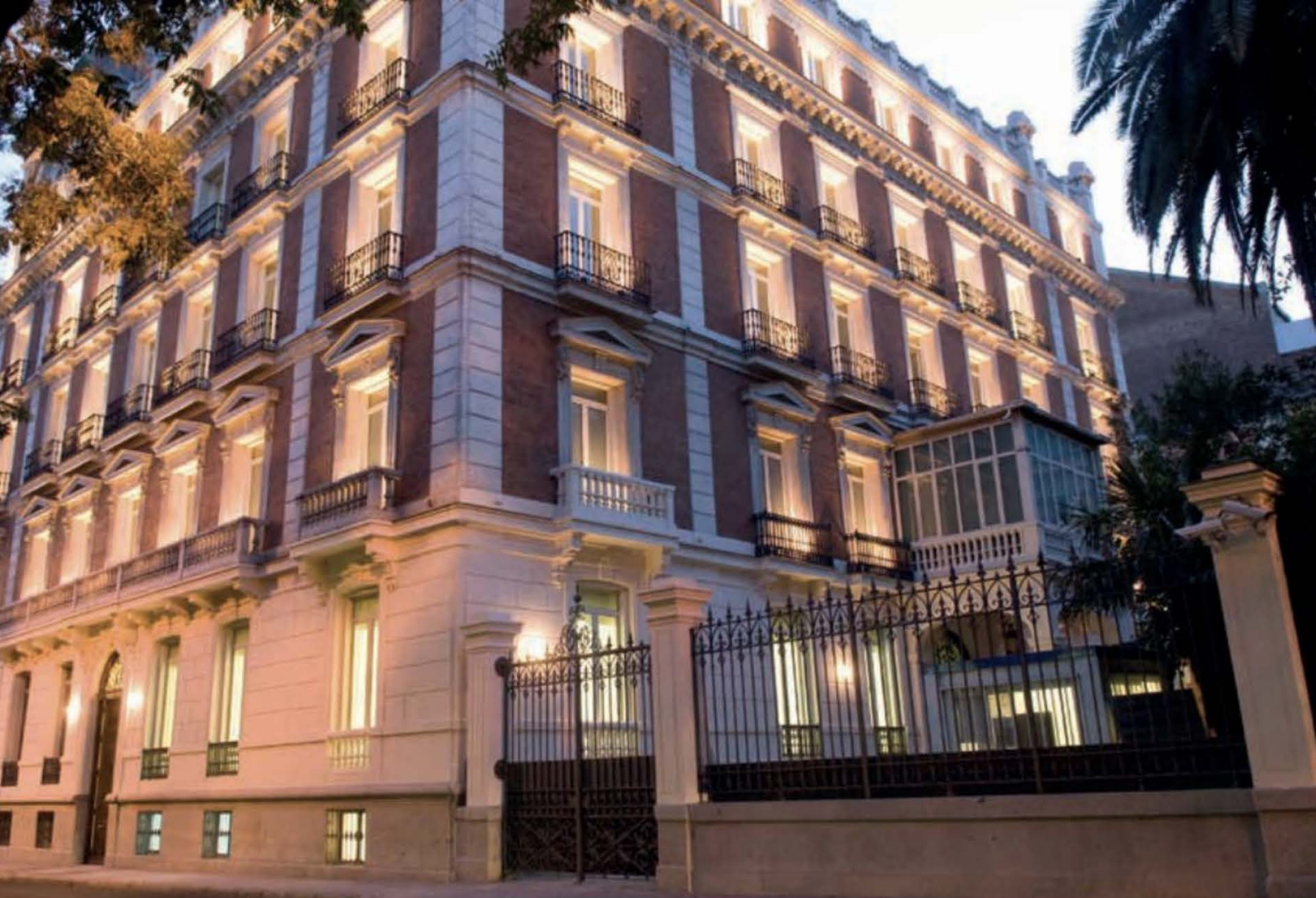
Fundación MAPFRE Madrid.